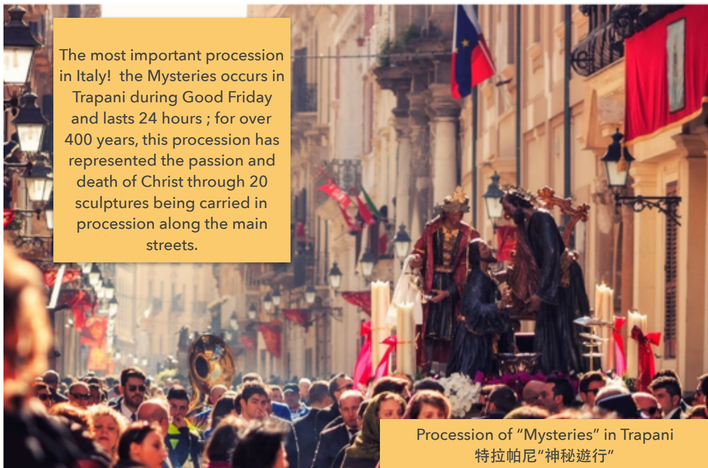
Procession of "Mysteries" in Trapani 特拉帕尼“神秘遊行”

The most important procession in Italy! the Mysteries occurs in Trapani during Good Friday and lasts 24 hours ; for over 400 years, this procession has represented the passion and death of Christ through 20 sculptures being carried in procession along the main streets.