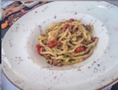
Busiate with modica chocolate