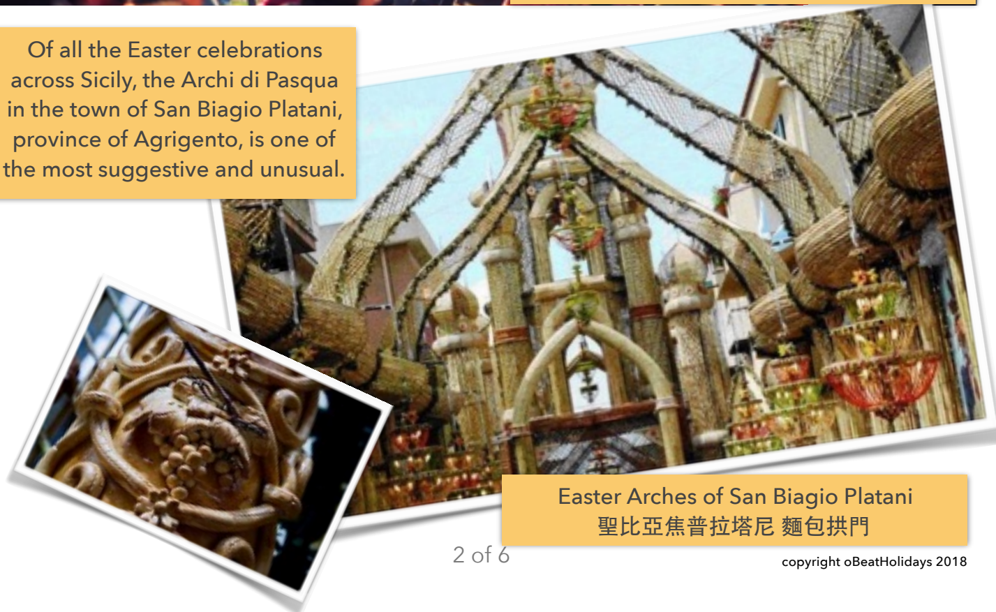
Easter Arches of San Biagio Platani 聖比亞焦普拉塔尼 麵包拱門

Of all the Easter celebrations across Sicily, the Archi di Pasqua in the town of San Biagio Platani, province of Agrigento, is one of the most suggestive and unusual.