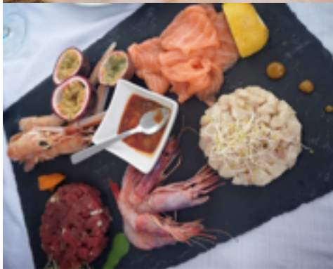
Raw seafood platter