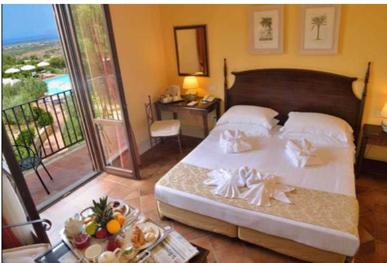
Baglio Oneto Wine Resort

(圖片只供參考，實際房間景觀由酒店安排，行程所包的是標準房間，一般為16-18m 2 ) Photos for reference only, actual room size subject to hotels' arrangement, typical standard room size range from 16-18m 2 )