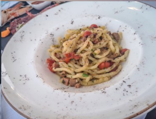
Busiate with modica chocolate