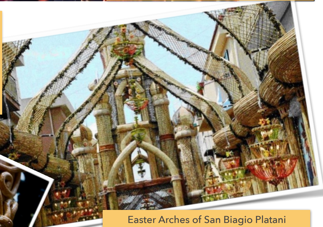
Easter Arches of San Biagio Platani 聖比亞焦普拉塔尼 麵包拱門

每逢復活節，西西里城鎮聖比亞焦普拉塔尼都會用麵包建造一座大教堂及拱門，代表著基督勝過死亡。拱門裝飾品全部由麵包，意大利面和水果，由人用手用幾個月時間製成。