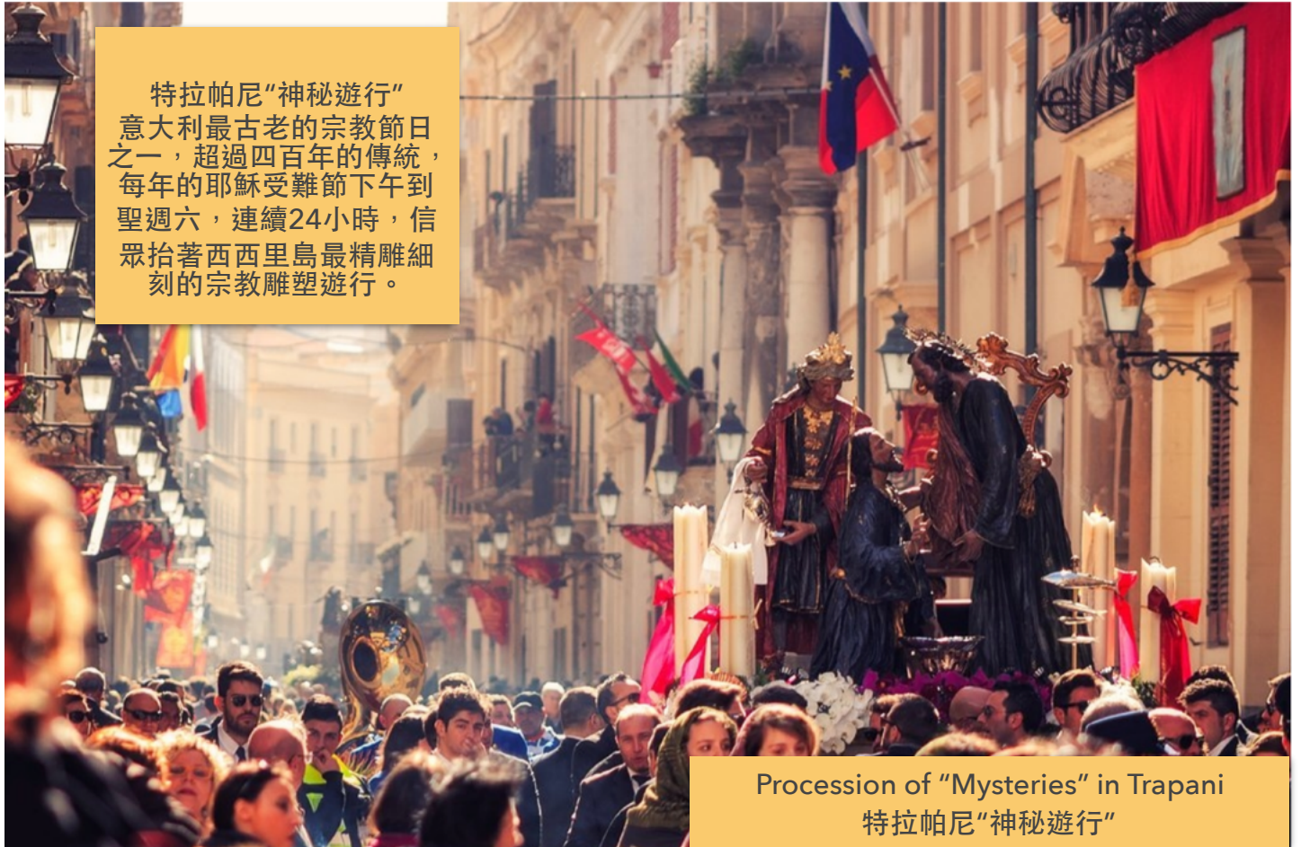
Procession of “Mysteries” in Trapani 特拉帕尼“神秘遊行”

特拉帕尼“神秘遊行” 意大利最古老的宗教節日之一，超過四百年的傳統，每年的耶穌受難節下午到聖週六，連續24小時，信眾抬著西西里島最精雕細刻的宗教雕塑遊行。