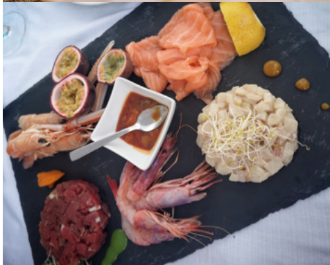
Raw seafood platter