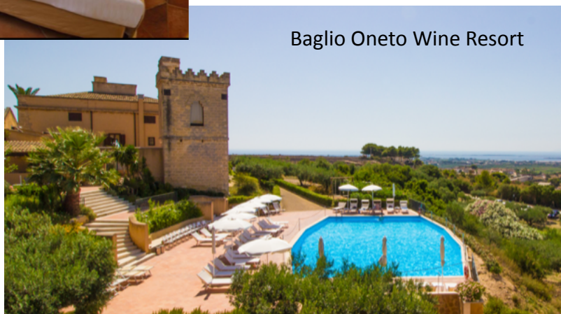
Baglio Oneto Wine Resort